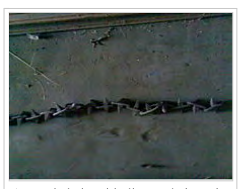
A metal chain with diamond-shaped link pins.