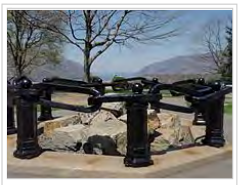
Part of The Hudson River Chain at West Point