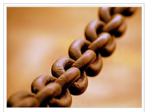
A broad metal chain made of torus-shaped links.